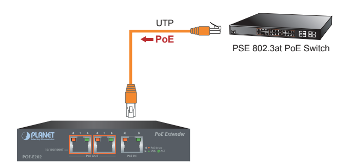
Step 2: The PSE delivers both Ethernet Data and PoE power over UTP cable to the Gigabit PoE Extender and the "PoE-in-use" and "LNK/ACT LED" will be lit steadily.

Step 1: Connect a standard Cat5e/6 UTP cable from power source equipment (PSE), such as PoE switch, PoE injector hub and single port PoE injector, to the "PoE IN" port of the Gigabit PoE Extender.